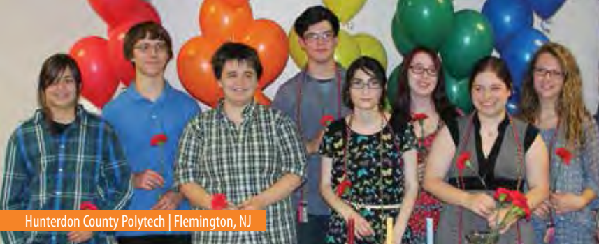
Hunterdon County Polytech | Flemington, NJ