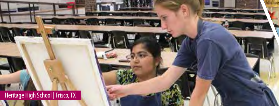
Heritage High School | Frisco, TX