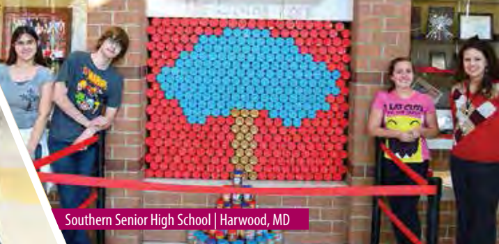
Southern Senior High School | Harwood, MD