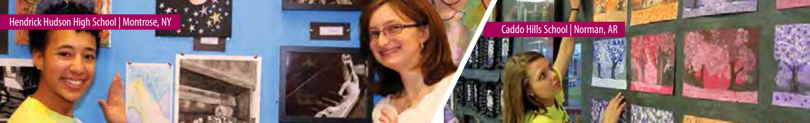
Hendrick Hudson High School | Montrose, NY