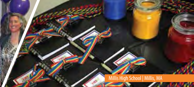
Millis High School | Millis, MA