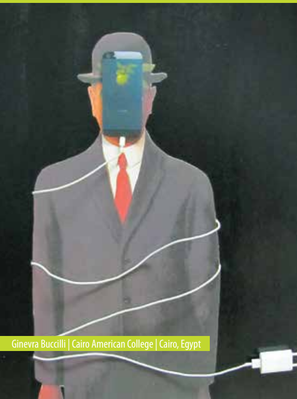
Ginevra Buccilli | Cairo American College | Cairo, Egypt

EVERY CHAPTER should address the following information within its bylaws: